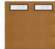
Top Section 38" x 14" or 26" x 14"

Note: Bottom section window will only be installed on the top of the section.