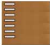
Left Stacked Vertical Column 24" x 6"