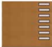
Right Stacked Vertical Column 24" x 6"