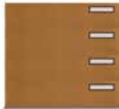
Top Section Stacked