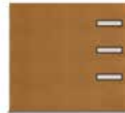
Bottom Section Stacked